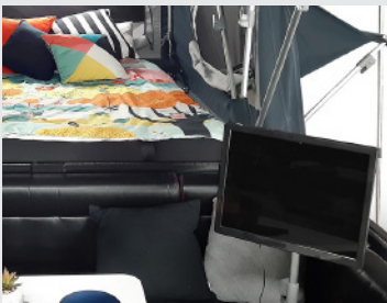
17 Inch LCD / LED Monitor & Multimedia player

LITHIUM BATTERY WITH PROJECTA CHARGER MANAGEMENT SYSTEM