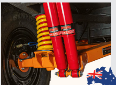
Australian Made & Engineered Suspension System