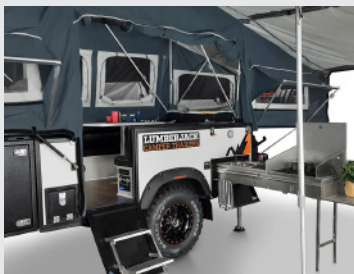
Huge Exterior Living Space with a Full Annex included