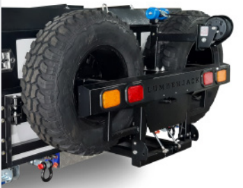
Two Spare Tyres included On Rear Drop Down Support

LITHIUM BATTERY WITH PROJECTA CHARGER MANAGEMENT SYSTEM