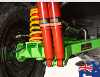
Australian Made & Engineered Suspension System