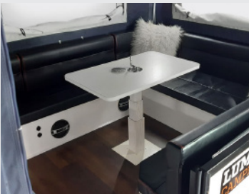
Large Seating Space Converts to Double Bed Area