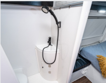
Interior Ensuite Room with Cassette Toilet & Shower