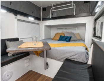
Spacious Interior with Dining Suite & Swing Away Table

LITHIUM BATTERY WITH PROJECTA CHARGER MANAGEMENT SYSTEM