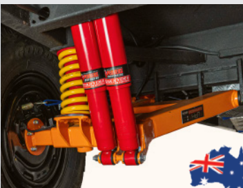
Australian Made & Engineered Suspension System