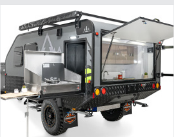
Rear Food Preparation Space With Cooker, Lighting & Sink