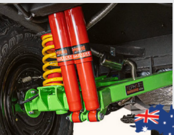
Australian Made & Engineered Suspension System