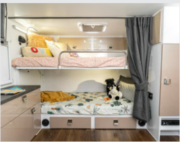
Dual Single Bunks for the Little Ones with Privacy Curtain

LITHIUM BATTERY WITH PROJECTA CHARGER MANAGEMENT SYSTEM